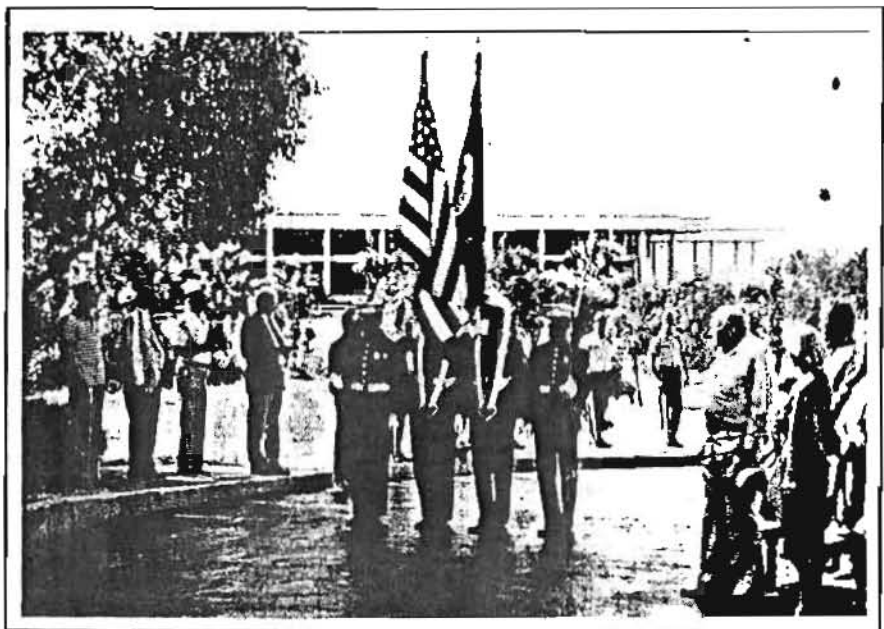
United States Marine Corps. Color Guard posts the colors at the Virginia Key Fete.

The Florida Chapter has been established to forward that goal.