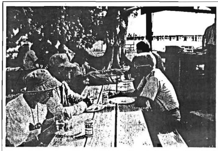
After it was all over, everyone enjoyed a cold beer and warm friendships.