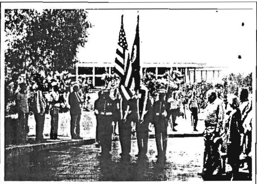
United States Marine Corps. Color Guard posts the colors at the Virginia Key Fete.

The Florida Chapter has been established to forward that goal.